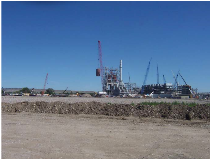
View across the Old Landfarm (2007)

CHS conducted an evaluation to determine potential risks to workers if exposed to hazardous constituents in landfarm soils. It was determined that concentration levels were below risk-based values for industrial workers in surface and most subsurface soils. Based on that evaluation, DEQ approved use of the surface of both landfarms, with restrictions, for refinery activities.